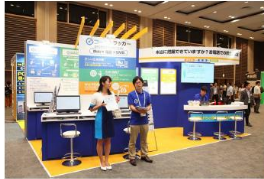
18sqm booth (6m x 3m)