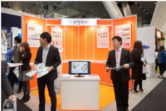
9sqm booth (3m x 3m)