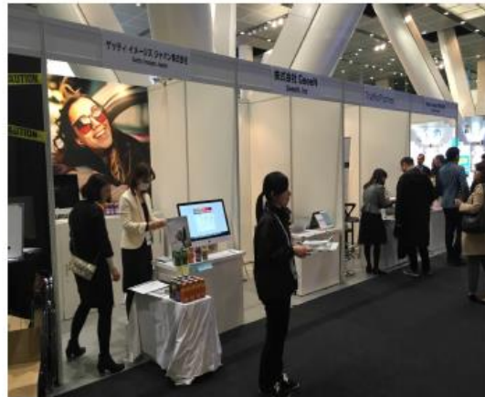
4sqm booth (2m x 2m)